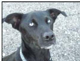
"Sky", owned by Lesley Robb

In order for your dog to receive this injection, it is required to perform basic bloodwork to check major organ function like the liver and kidneys, as well as evaluate your pet's heartworm status. This can be done along with your pet's yearly visit or can be scheduled as a separate appointment. This injection also cannot be given within 30 days of your animal receiving vaccinations. If you decide you are interested in