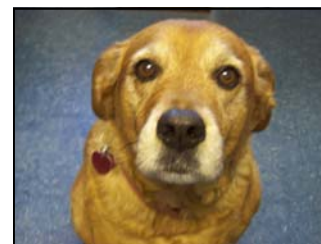
“Simba”, owned by the Joseph family

Certain symptoms or changes in behavior can indicate a variety of health issues, including diabetes, arthritis, dental disease, thyroid disease, cancer, and diseases of major organs such as the kidneys, liver, and heart. Because these health problems can arise before any symptoms start, we now draw blood for basic labwork at your geriatric pet’s yearly visits. This bloodwork tests the function of many major organs such as the liver and kidneys and can determine whether your pet is in the early stages of certain diseases that are more common in older animals, which can possibly make treatment easier and less invasive. If tests are