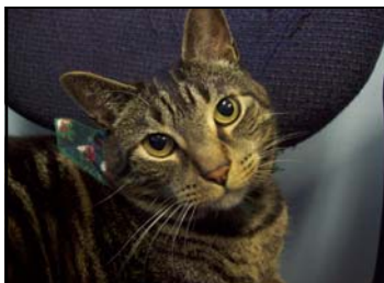
“Mittens”, owned by Northwoods Vet Clinic

With advances in veterinary medicine over the years, pets today are living longer and longer lives. Unfortunately, as they become older they are at a higher risk for a variety of health issues and there may be more that is required of you as a pet owner to ensure that they are in the best of health. At our clinic, we consider animals over the age of 8 to be geriatric. As your pet approaches this age and beyond, there are a few things you should be observing a little more closely as they can be key indicators of common geriatric health problems. These things include: